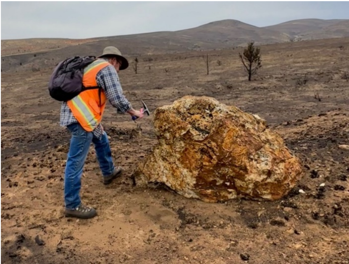
Figure 1 - Newly confirmed mineralized zone that is several hundred yards away but projects into last year's RC-04 that ended in 32 meters of 3.982 g/t gold.