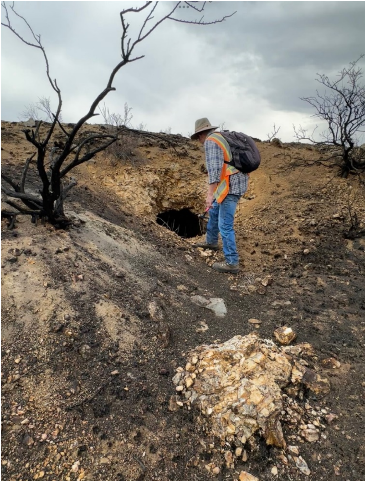
Figure 2 – A new historical prospect discovered after the wildfire